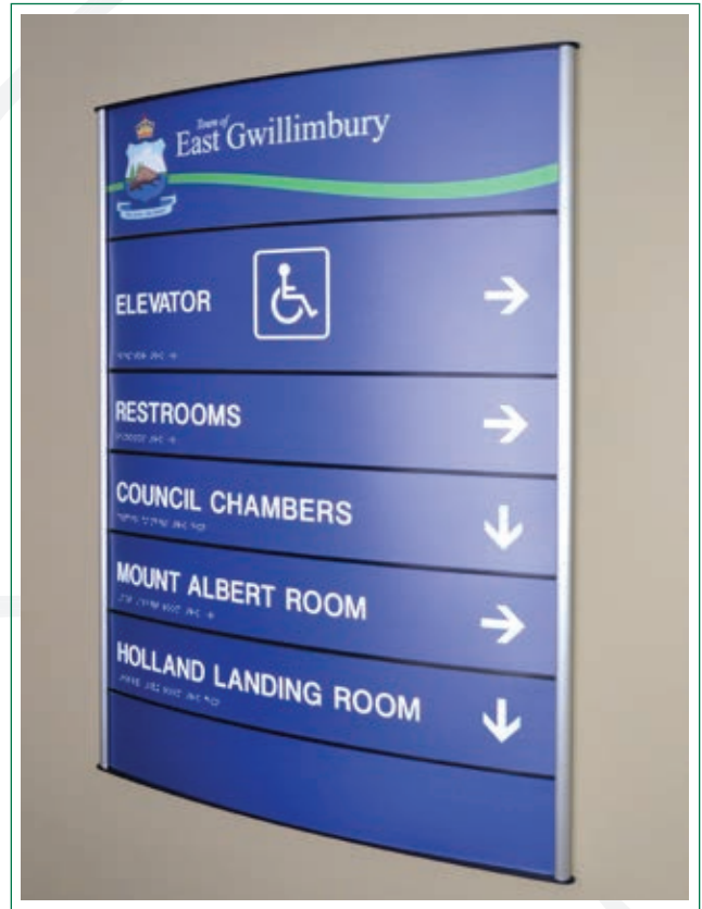
Town of East Gwillimbury Tactile & Braille signage