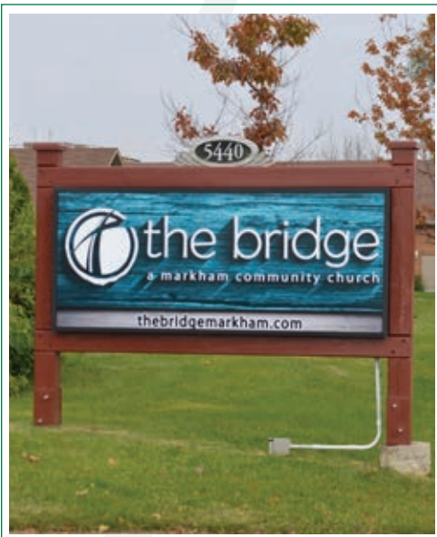
The Bridge backlit sign