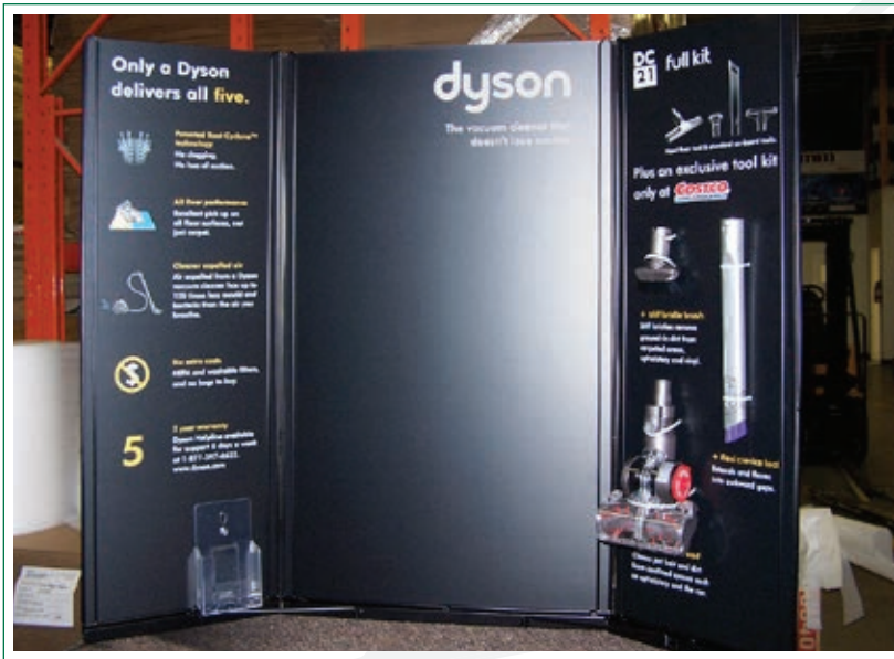
Dyson Costco fixture