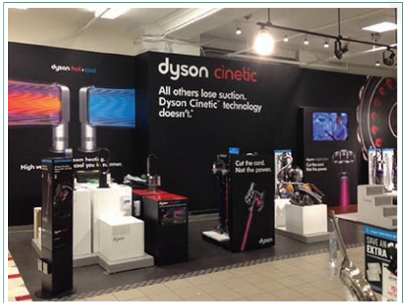
Dyson in-store displays