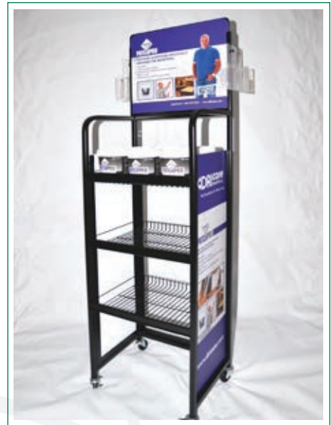
PatchPro prototype fixture