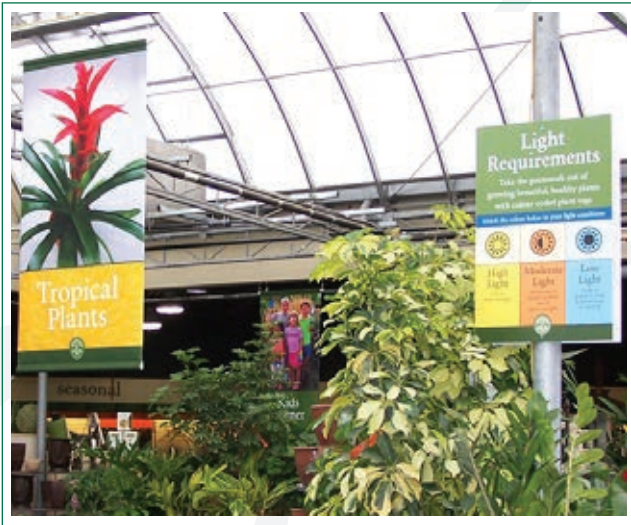
Sheridan POP signage

Smartlink will work with you from conceptual designs, through prototyping to installation keeping budgetary and design concerns in check. Our vast experience assures functional displays with stunning effects for your next project.