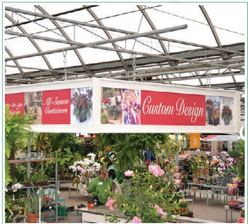
Sheridan counter signage

ADDITIONAL SERVICES please visit our website for more information